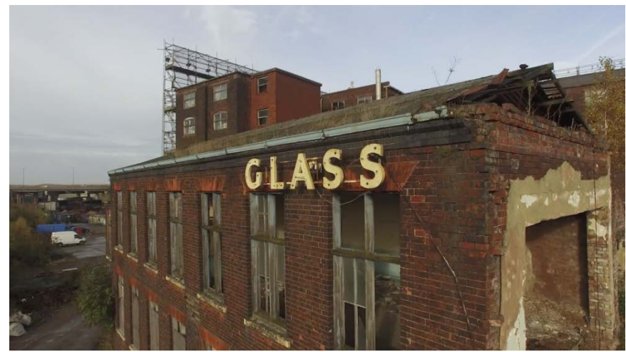
The Heritage listed Chance Bros Glass Works