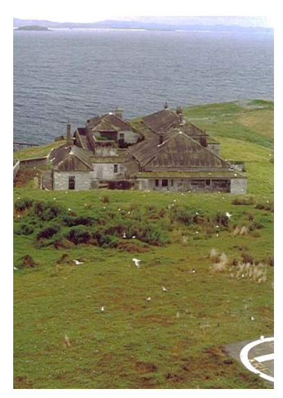
Before restoration (est. 2001)

Members are invited to offer their assistance with working bees carried out 2-3 times a year under the direction of the National Parks and Wildlife Service (NPWS). This provides a unique opportunity to visit the island and contribute to habitat restoration along with maintenance and preservation works on the island cottages.